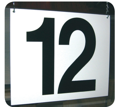
Durable, UV-resistant dock-door sign

Dock signs - Loading dock doors should be clearly labeled with large signs — both inside and out — to support the efficient movement of inbound deliveries and outbound shipments. Be sure that your outdoor signs are manufactured with durable materials and graphics that are able to withstand wind, rain and ultraviolet rays from the sun, which can cause fading and deterioration. Anodized aluminum material with UV-resistant graphics is typically a good solution to stand up to Mother Nature for several years.