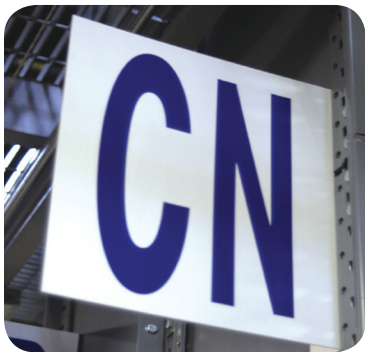
Two-sided aluminum aisle marker

Aisle signs - Typically located at the end of aisles, these human-readable signs identify rack location areas to support efficient stocking and picking of inventory. Aisle signs come in a wide variety, including flat, cube and teepee designs.